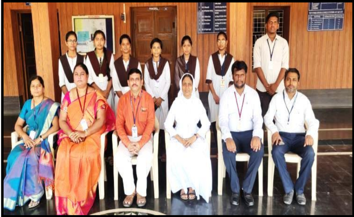
STUDENT GRIEVANCE CELL MEMBERS AND STUDENT VOLUNTEERS

Ph: 08645-236255, 236722, 9912342142 E-mail: npcp_csagp@yahoo.co.in Web site: www.npcpacsag.ac.in