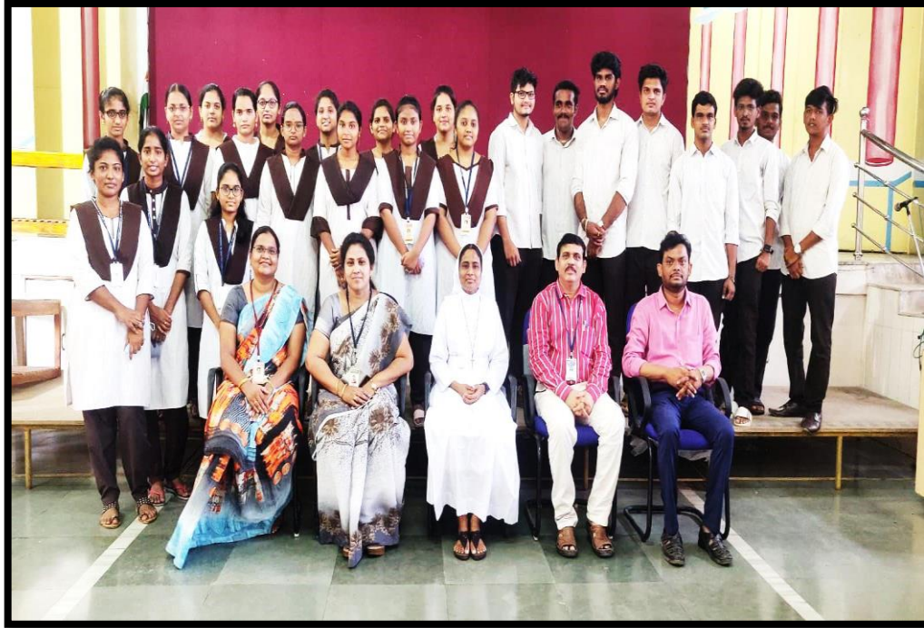
ANTI –RAGGING COMMITTEE MEMEBERS AND STUDENT VOLUNTEERS

Ph: 08645-236255, 236722, 9912342142 E-mail: nepa_csagp@yahoo.co.in Web site: www.ncpacsag.ac.in